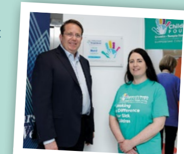
West Pharma really are a fundraising powerhouse – happy 100th!

This generous support has been instrumental in funding essential life-saving equipment, advancing medical research, and enhancing patient and parent services. Thank you so much!