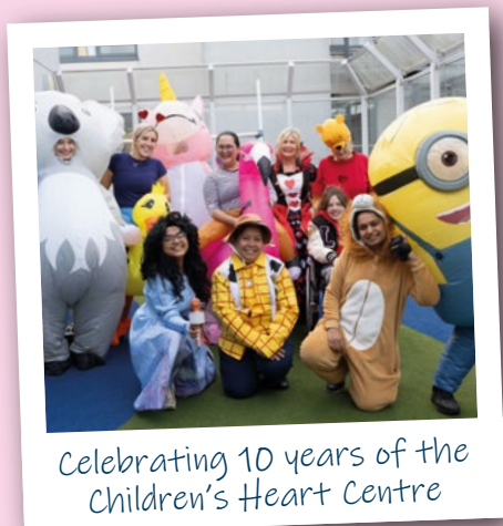
Celebrating 10 years of the Children's Heart Centre