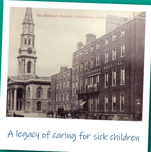
A legacy of caring for sick children

Please tick the box on the enclosed form for more information or contact Caroline Cummins at ccummins@childrenshealth.ie for enquiries in confidence.