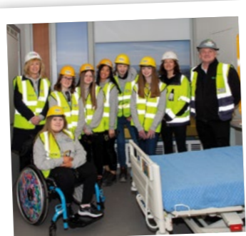
The Youth Advisory Council on a tour of the new hospital

There is a lot of work to be completed over the coming months, and throughout the process Children's Health Ireland wants to make